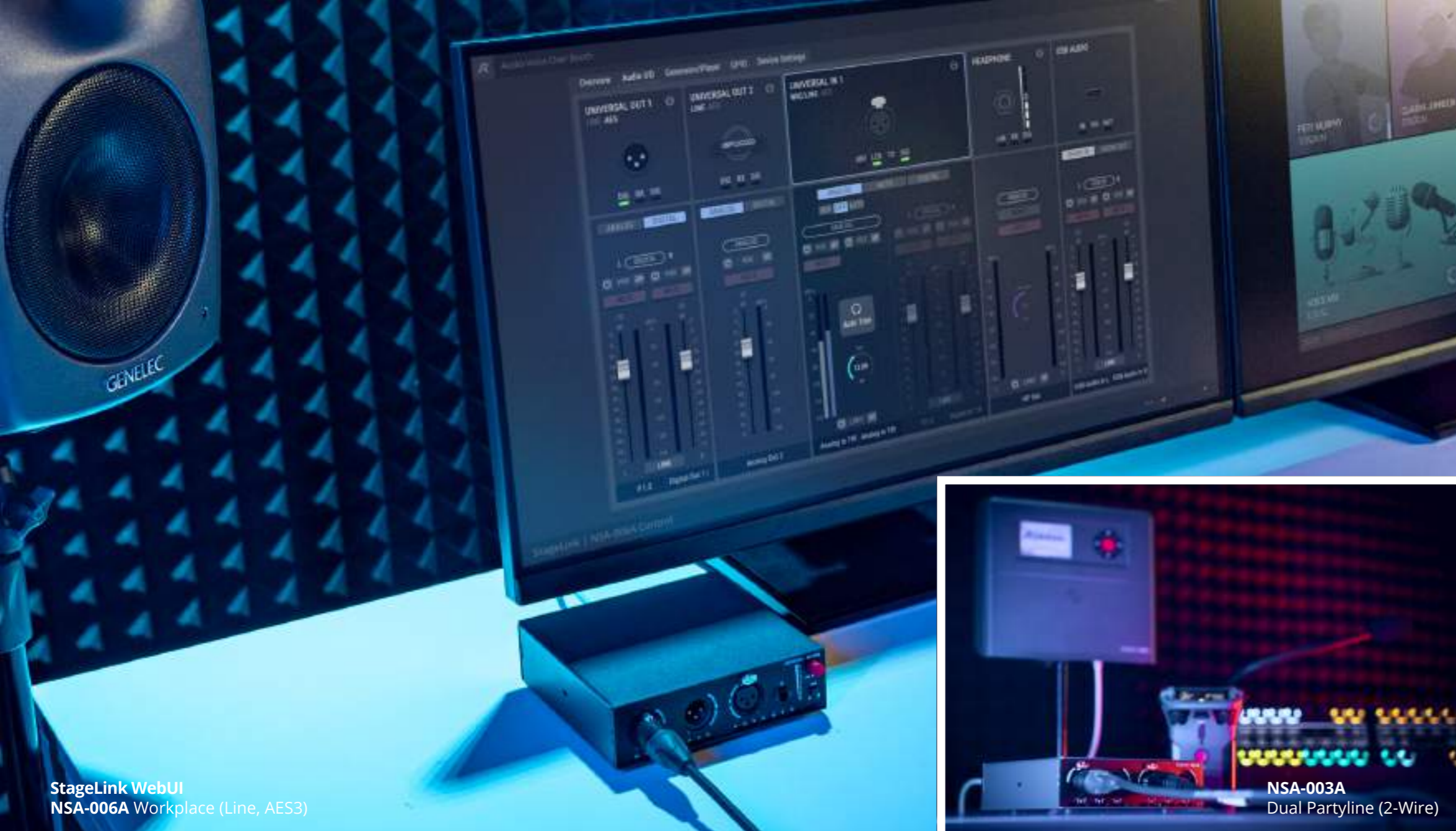
StageLink WebUI NSA-006A Workplace (Line, AES3)