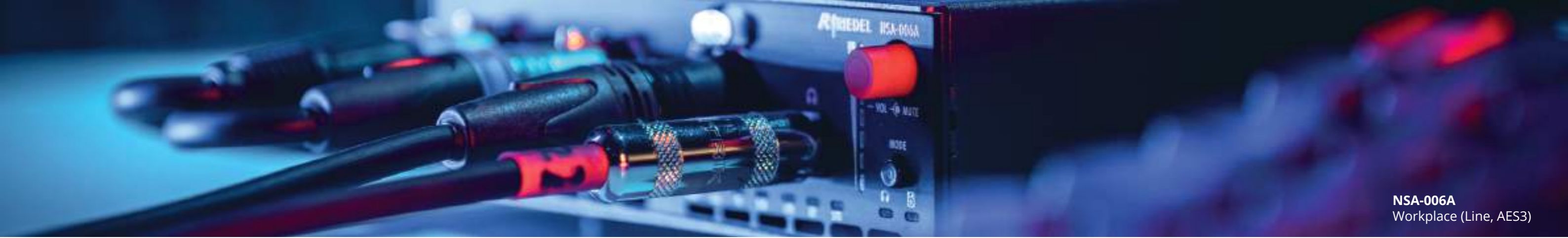
NSA-006A Workplace (Line, AES3)